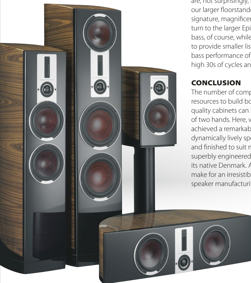
◁ THE REVIEWED EPICON 6 (LEFT) WITH THE LARGER EPICON 8 AND STANDMOUNT EPICON 2, PLUS THE VOKAL CENTRE-CHANNEL SPEAKER WHICH ENABLE HOME THEATRE EPICON SYSTEMS.